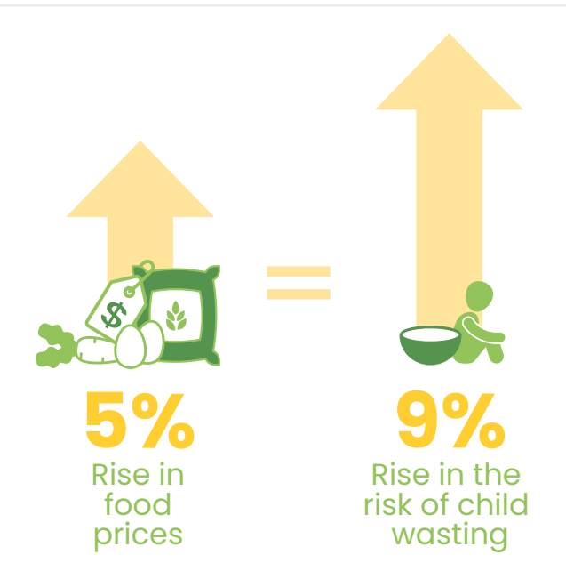
Figure 2. Food price inflation dramatically impacts wasting: a five percent rise in food inflation equals a nine percentage increase in risk of moderate/severe wasting

The impact was much larger in particular sub-population groups. The risk of wasting from food inflation is about 1.5 times higher for children in households that are asset-poor compared to children in non-poor households*. In rural areas, children in households that do not own land and cannot grow their own food