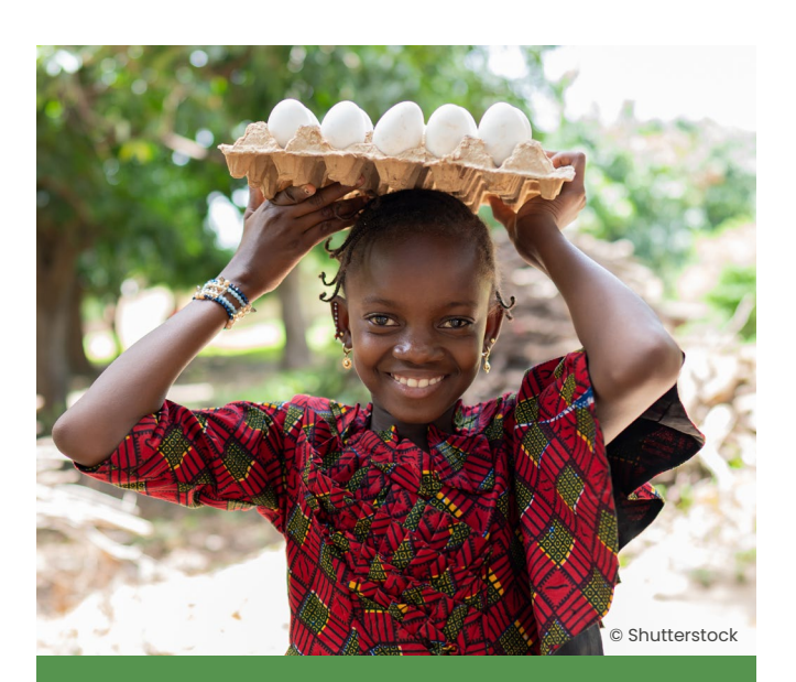
Call to Action

Lastly, limited and inadequate data to help guide programs and track progress is hindering progress. Investments and systems that can provide real-time data on child nutrition status are essential, particularly in crises contexts, to help target and design effective programs for the most vulnerable, and considering stretched resources.