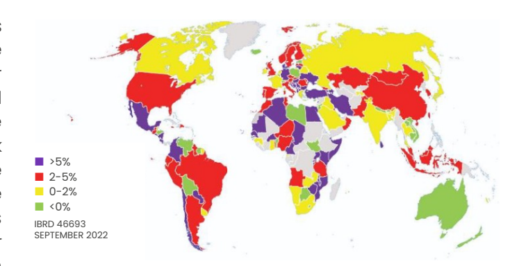
Figure 3. Changes in real food prices, latest 12-month values recorded over May-August 2022

A recent FAO analysis on quarterly food price increases indicates rising food prices throughout 2022 with the first quarter experiencing a 13.1% increase from the prior quarter followed by a further increase in the second quarter of 18.3%, signaling a looming threat to the nutritional well-being of mothers and an alarming risk for an increase in child wasting, the most immediate and serious form of malnutrition. Figure 3 shows the hotspots, where over 25 low and middle countries are currently experiencing food price inflation of over five percent (in purple). Many children in countries in sub-Saharan Africa, Asia, and Central America are particularly vulnerable to the increased risk of wasting due to reliance on imported food, unprecedented climate events, such as the recent catastrophic flooding in Pakistan, or on-going conflicts, such as Yemen and Ethiopia.